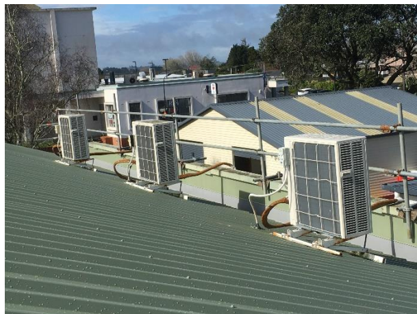
With three air-con units.