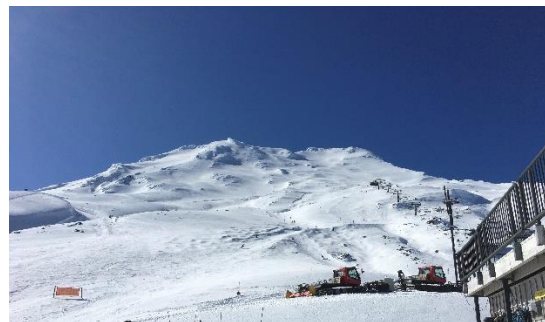
It looks pretty nice