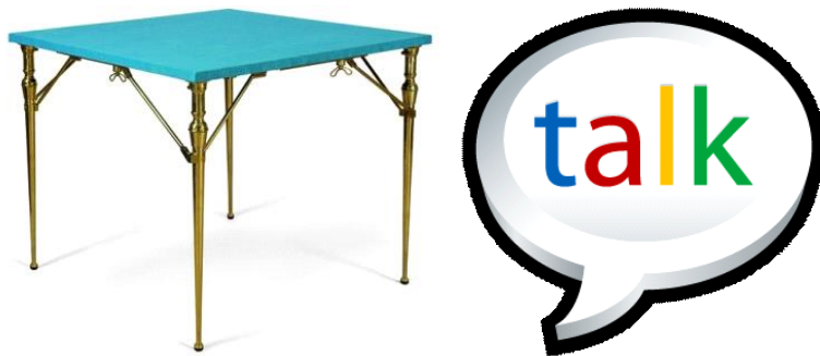
TABLE TALK – August 2020