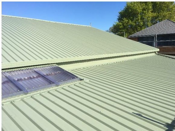
How's that for a nice roof?